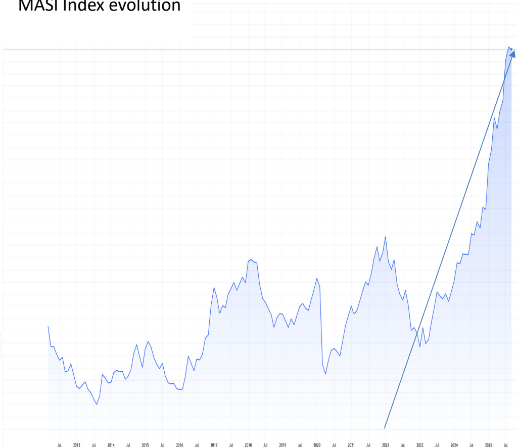
MASI Index evolution